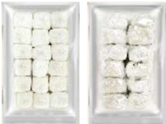
Soft Mochi (Red Bean) Box: 4pack (55g*72ea/pack) or 5pack (55g*12ea/pack) · BB: 12 months in freezing