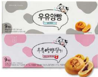
Mini Milky Bun 9P (Milky/ Milky Strawberry Jam) Box: 12pack (35g*9ea/pack) BB: 12 months in freezing