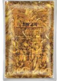
Dried Pumpkin Dice

Box: 4pack (2.5kg/pack) BB: 12 months in freezing