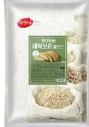
Barley Grass Powder For Bread