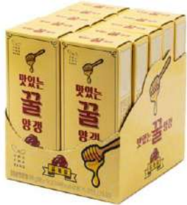
Red Bean Jelly 10P Box: 4set (80g*10ea/set) BB: 12 months