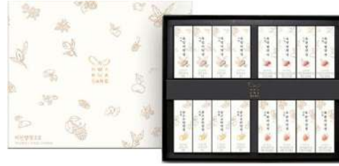
Jihyun Gift Set (Medium) Box: 8set (45g*16ea/set) BB: 12 months (Red Bean/ Black Sesame/ Raspberry/ Sweet Potato)