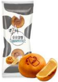
Mini Milky Bun 3P Box: 8pack (23g*3ea/pack) BB: 12 months in freezing