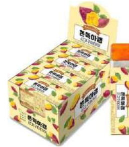
Stick Jelly (Sweet Potato) Box: 18set (45g*12ea/set) BB: 12 months