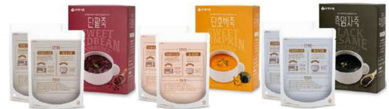
Korean Rice Porridge (Red Bean/ Pumpkin/ Black Sesame) Box: 10pack (200g*2pouch/pack) BB: 12 months