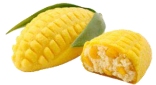
Corn Bread Box: 4pack (70g*15ea/pack) BB: 12 months in freezing