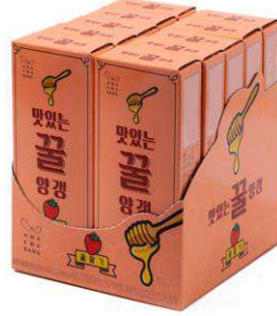
Strawberry Jelly 10P Box: 4set (80g*10ea/set) BB: 12 months