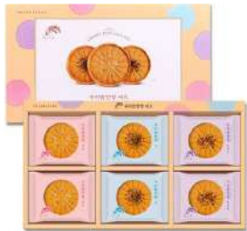
Korean Rice Biscuit(Gift Set) Box: 8set (24g*18ea/set) BB: 12 months