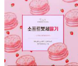
Soft Bouchee (Strawberry) Box: 35g*8ea*6pack BB: 12 months in freezing