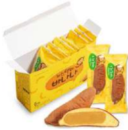
Castella Banana (White Bean-Banana) Box: 6pack (40g*6ea/pack) BB: 12 months in freezing