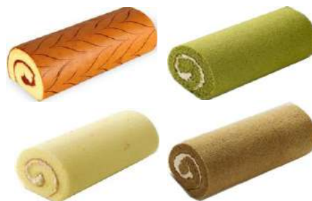
Soft Roll Cake (Strawberry Jam/ Cream/ Green Tea/ Mocha) Box: 2pack (450g*6ea/pack) BB: 12 months in freezing