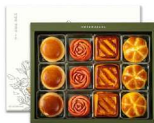
Sweet Mini Bun (Small) - Gift Box: 10set (627g/set) BB: 12 months in freezing