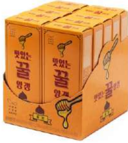
Chestnut Jelly 10P Box: 4set (80g*10ea/set) BB: 12 months