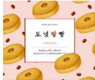
Baked Mini Donut (Red Bean) Box: 6pack (85g*8ea/pack) BB: 12 months in freezing