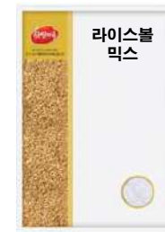
Rice Flour For Donut Hole