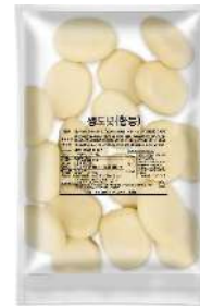
Soft Donut (Sweet Potato) Box: 5pack (60g*20ea/pack) BB: 12 months in freezing