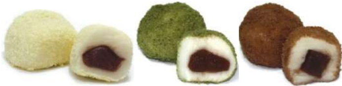
Sticky Rice Ball (Plain/ Mugwort/ Choco) Box: 5pack (25g*12ea/pack) BB: 12 months in freezing