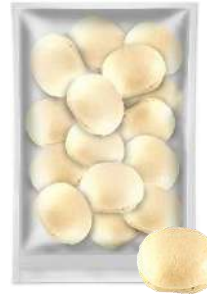
Puffy Bread (Plain) Box: 5pack (90g*10ea/pack) BB: 12 months in freezing