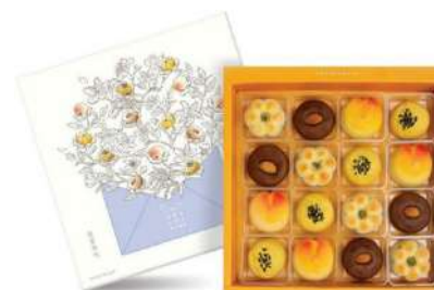
Jeong) Mini Bun - Gift Box: 10set (544g/set) BB: 12 months in freezing