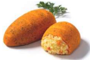
Carrot Bread Box: 4pack (70g*15ea/pack) BB: 12 months in freezing