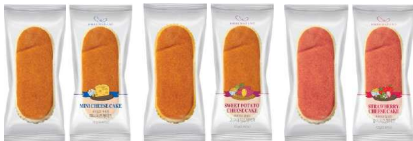
Mini Cheese Cake - B2B/B2C (Plain/ Sweet Potato/ Strawberry) Box: 2pack (70g*30ea/pack) BB: 12 months in freezing