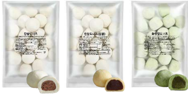
Sticky Rice Donut (Red Bean/ Whole Red Bean/ Mugwort) Box: 4pack (75g*20ea/pack) BB: 12 months in freezing