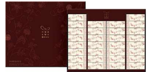
Korean Red Ginseng Jelly Gift Set (Large) Box: 5set (45g*30ea/set) BB: 12 months