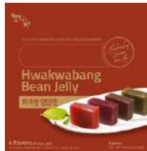
Jelly 6P Box: 40g*6ea*36set BB: 12 months (Red Bean/ Green Tea/ Strawberry/ Sweet Potato)