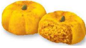
Sweet Pumpkin Bread Box: 4pack (90g*15ea/pack) BB: 12 months in freezing