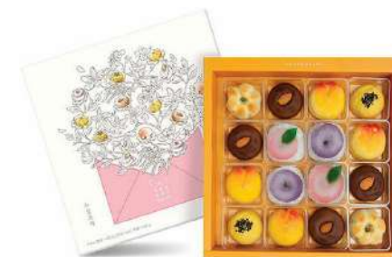
Soo) Mini Bun - Gift Box: 10set (628g/set) BB: 12 months in freezing