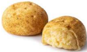
Potato Bread Box: 4pack (90g*15ea/pack) BB: 12 months in freezing