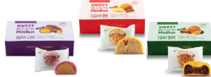
Mini Bun(Sweet Potato/ Chestnut/ Sweet Pumpkin) Box: 12pack (35g*5ea/pack) BB: 12 months in freezing