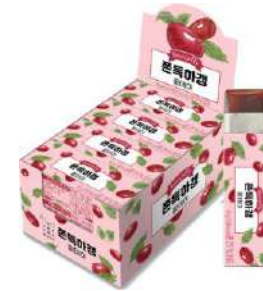
Stick Jelly (Red Bean) Box: 18set (45g*12ea/set) BB: 12 months