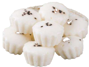
Mini Rice Cake Box: 12pack (30g*50ea/pack) BB: 12 months in freezing