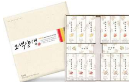
Mixed Jelly Gift Set Box: 630g(45g*14ea)*8set BB: 12 months (Red Bean/ Black Sesame/ Raspberry/ Sweet Potato)