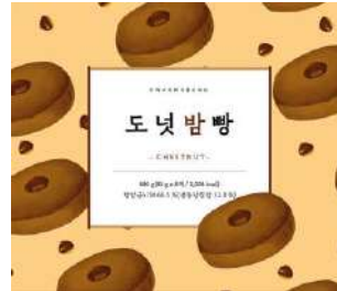
Baked Mini Donut (Chestnut) Box: 6pack (85g*8ea/pack) BB: 12 months in freezing