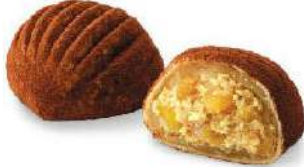
Chestnut Bread Box: 4pack (90g*15ea/pack) BB: 12 months in freezing