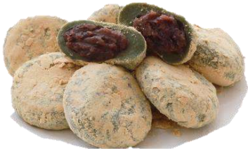
Mugwort Rice Cake Box: 10pack (60g*28ea/pack) BB: 12 months in freezing