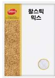
Rice Flour For Stick Donut