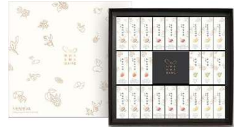
Jihyun Gift Set (Large) Box: 8set (45g*24ea/set) BB: 12 months (Red Bean/ Mugwort/ Black Sesame/ Raspberry/ Sweet Potato)