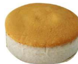
Cake Sheet(Size 1/2/3) Box: 2pack (450g*6ea/pack) BB: 12 months in freezing