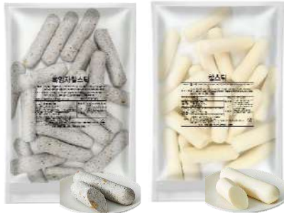
Stick Donut (Injeolmi/ Black Sesame) Box: 5pack (60g*20ea/pack) BB: 12 months in freezing