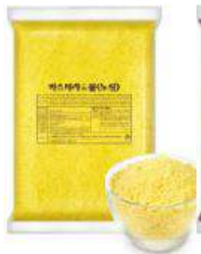
Castella Crumb (Yellow/Choco/White)

Box: 4pack (2kg/pack) BB: 12 months in freezing