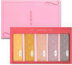
Jelly 5P Box: 21set (100g*5ea*/set) BB: 12 months (Citron/ Sweet Potato/ Red Bean/ Persimmon/ Black Sesame)