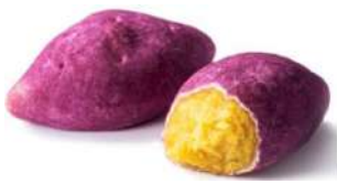
Sweet Potato Bread Box: 4pack (90g*15ea/pack) BB: 12 months in freezing