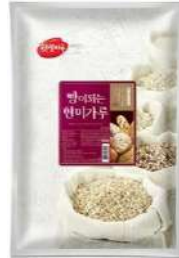
Brown Rice Powder For Bread