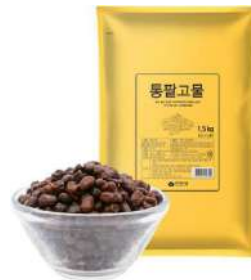
Cooked Whole Red Bean