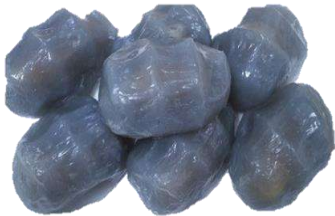
Potato Rice Cake Box: 1pack (40g*200ea/pack) BB: 12 months in freezing