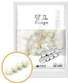
Soft Mochi Ball Box: 4pack (45g*23ea/pack) BB: 12 months in freezing