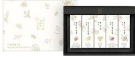
Jihyun Gift Set (Small) Box: 24set (45g*5ea/set) BB: 12 months (Red Bean/ Mugwort/ Black Sesame/ Raspberry/ Sweet Potato)