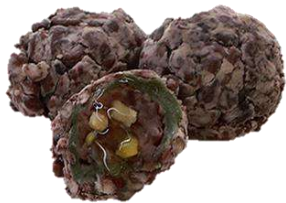
Omegi Rice Cake Box: 10pack (60g*20ea/pack) BB: 12 months in freezing