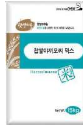
Glutinous Rice Flour For Flat Mochi