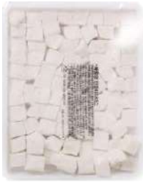
Diced Mochi Box: 6pack (800g/pack) BB: 12 months in freezing