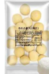
Rice Ball (Custard) Box: 4pack (75g*20ea/pack) BB: 12 months in freezing