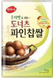
Glutinous Rice Flour For Donut