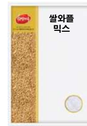
Rice Flour For Waffle