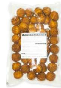
Mini Walnut Bun Box: 6pack (20g*50ea/pack) BB: 12 months in freezing