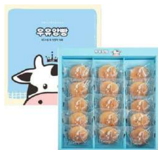
Milky Bun Set Box: 6set (35g*15ea/set) BB: 12 months in freezing