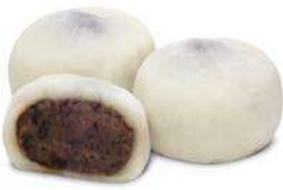
Whole Red Bean Walnut Mochi Box: 2pack (95g*25ea/pack) BB: 12 months in freezing