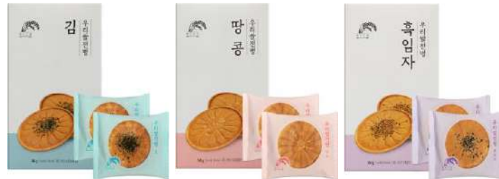
Korean Rice Biscuit (Seaweed/ Peanut/ Black Sesame) Box: 15pack (24g*6ea/pack) BB: 12 months