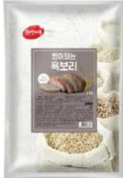
Black Barley Rice Flour For Bread