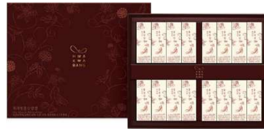
Korean Red Ginseng Jelly Gift Set (Medium) Box: 8set (45g*16ea/set) BB: 12 months