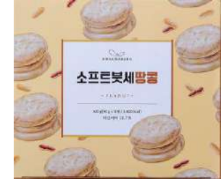
Soft Bouchee (Peanut Butter) Box: 40g*8ea*6pack BB: 12 months in freezing