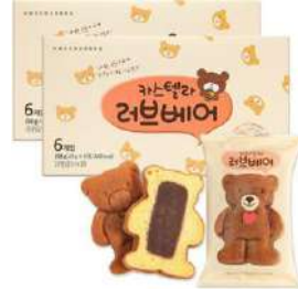
Castella Lovely Bear (Red Bean) Box: 8pack (43g*6ea/pack) BB: 12 months in freezing