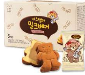
Castella Milk Bear (Milk) Box: 8pack (37g*6ea/pack) BB: 12 months in freezing