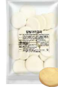
Flat Mochi (Plain/ Black Sesame) Box: 3pack (90g*20ea/pack) BB: 12 months in freezing