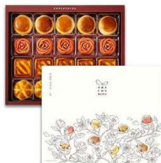
Sweet Mini Bun (Large) - Gift Box: 6set (1,045g/set) BB: 12 months in freezing