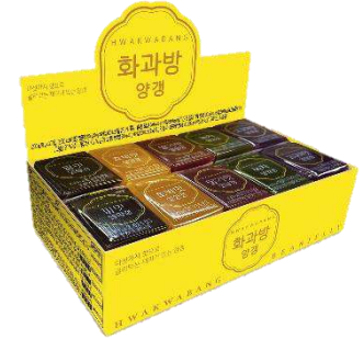
Mixed Jelly 30P(C) Box: 9set (40g*30ea/set) BB: 12 months (Red Bean/ Sweet Potato/ Strawberry/ Green Tea/ Pumpkin)