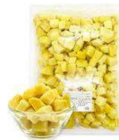
Diced Sweet Potato

Box: 5pack (2kg/pack) BB: 12 months in freezing