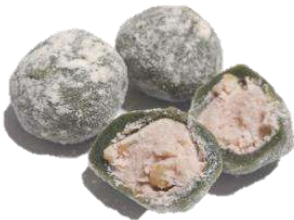
Du Teop Rice Cake Box: 10pack (60g*30ea/pack) BB: 12 months in freezing