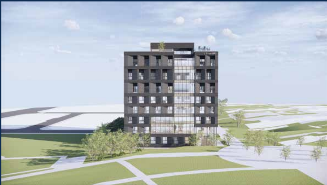
FromBIO Headquarters Building located in Yongin-si, Gyeonggi-do