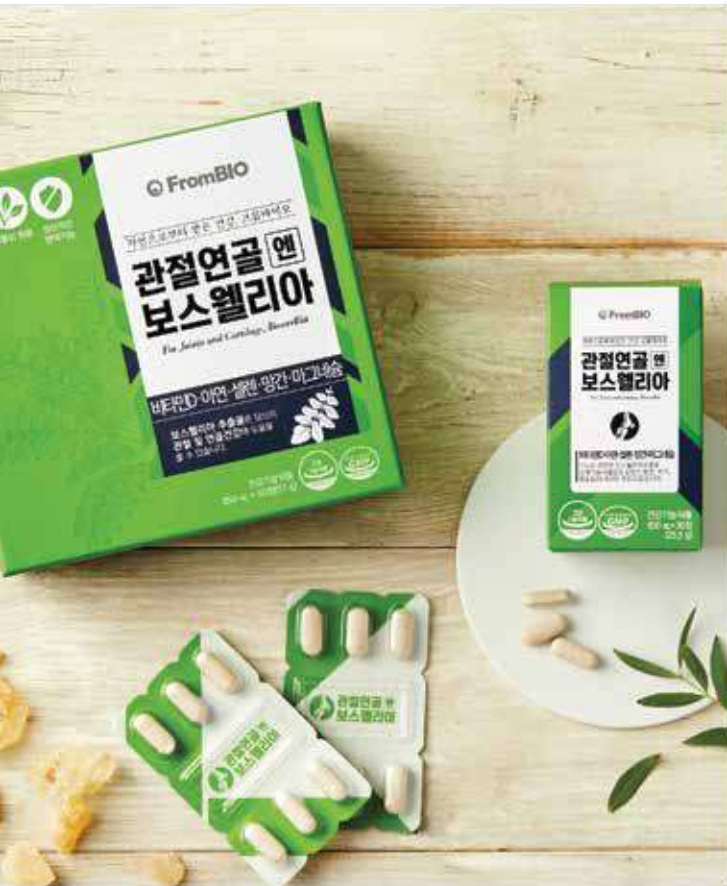
Functional health food Starting point for health care

FromBIO offers functional health foods using the best ingredients that are individually approved and rigorously selected. In addition, FromBIO offers an anti-aging cosmetic line using high quality premium ingredients as well as daily consumer products.