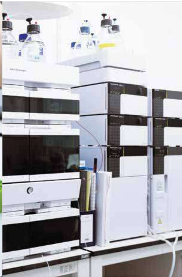
Bio research laboratory