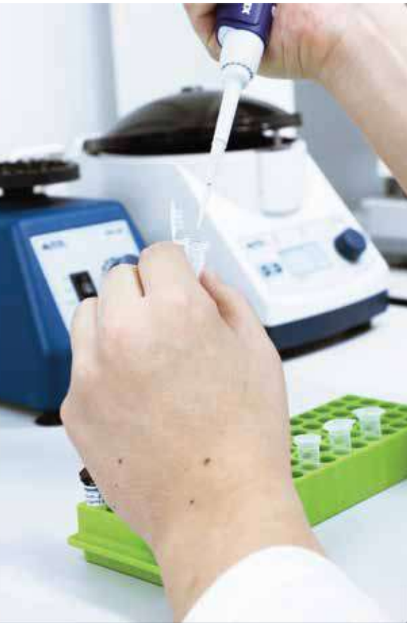
Food research laboratory

One of our notable manufacturing facilities, the GMP Factory, is responsible for producing functional health foods, including The Jinhan Red Ginseng Stick (concentrate) made with 6-Year-Old Red Ginseng. We take immense pride in our ability to deliver quality products, which undergo thorough quality inspections to ensure excellence. Furthermore, we have established the FromBIO Logistics Center, which was completed in 2022, to provide efficient logistics services and ensure prompt delivery to our valued customers.