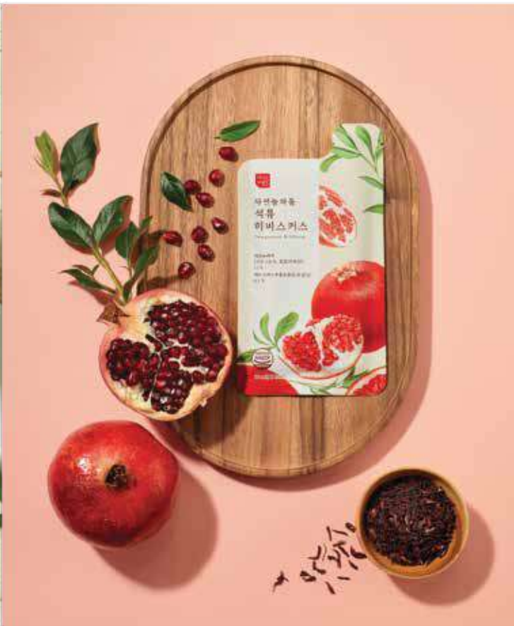
Health food Beginning for vibrant life