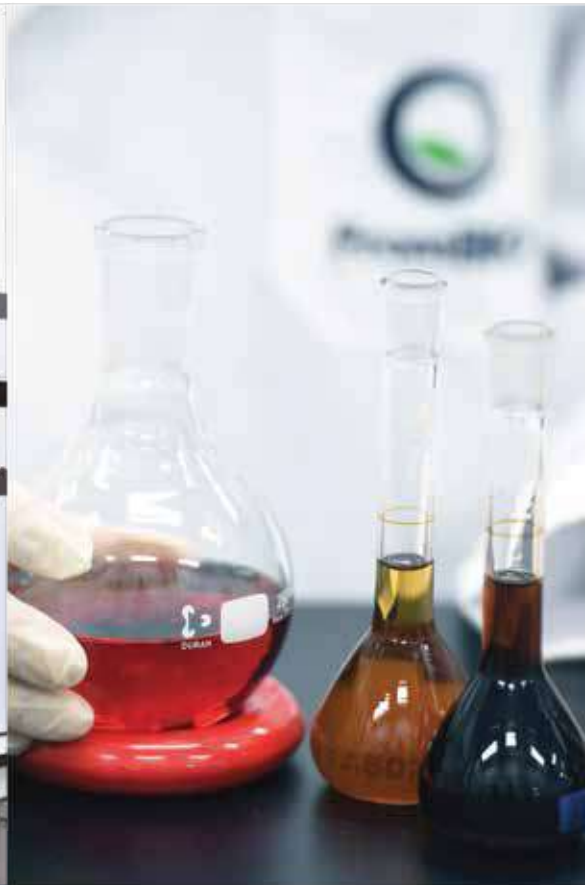
New drug research laboratory