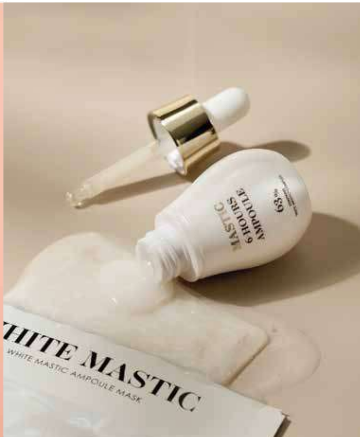
Cosmetic products Anti-aging with only premium ingredients