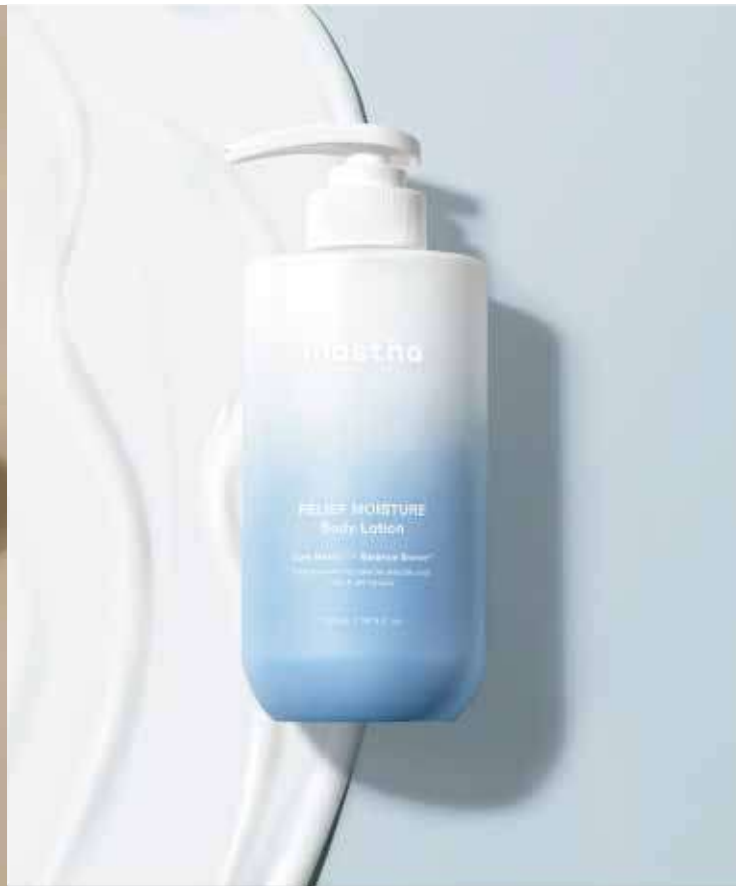
Personal care products Beginning for healthy life