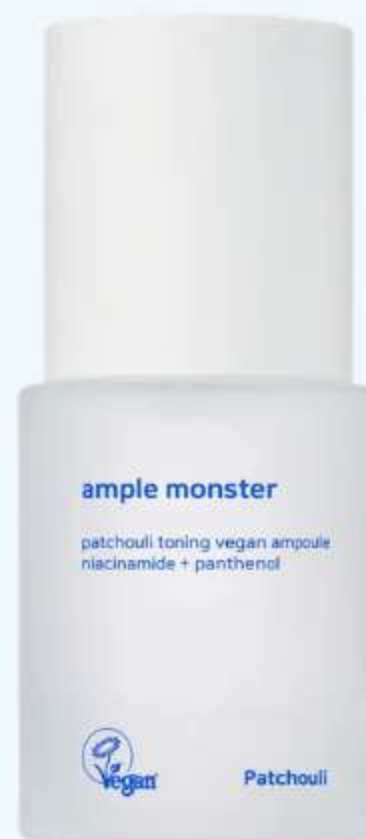
Patchouli Toning Vegan Ampoule

04 Melanin Reduction & Spot Care Alpha-Bisabolol