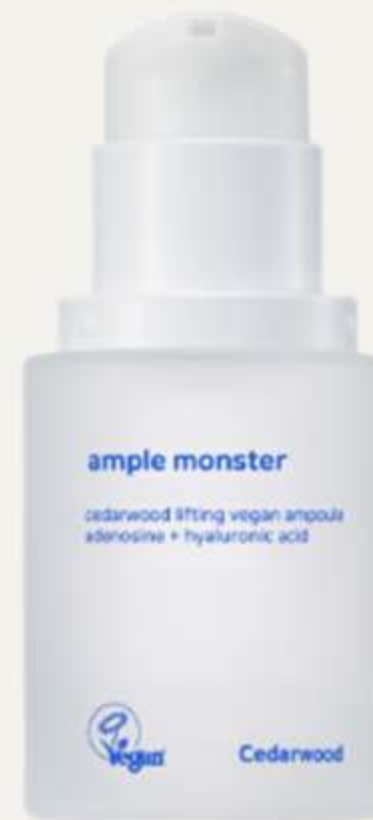
Cedarwood Lifting Vegan Ampoule