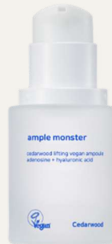
Cedarwood Lifting Vegan Ampoule