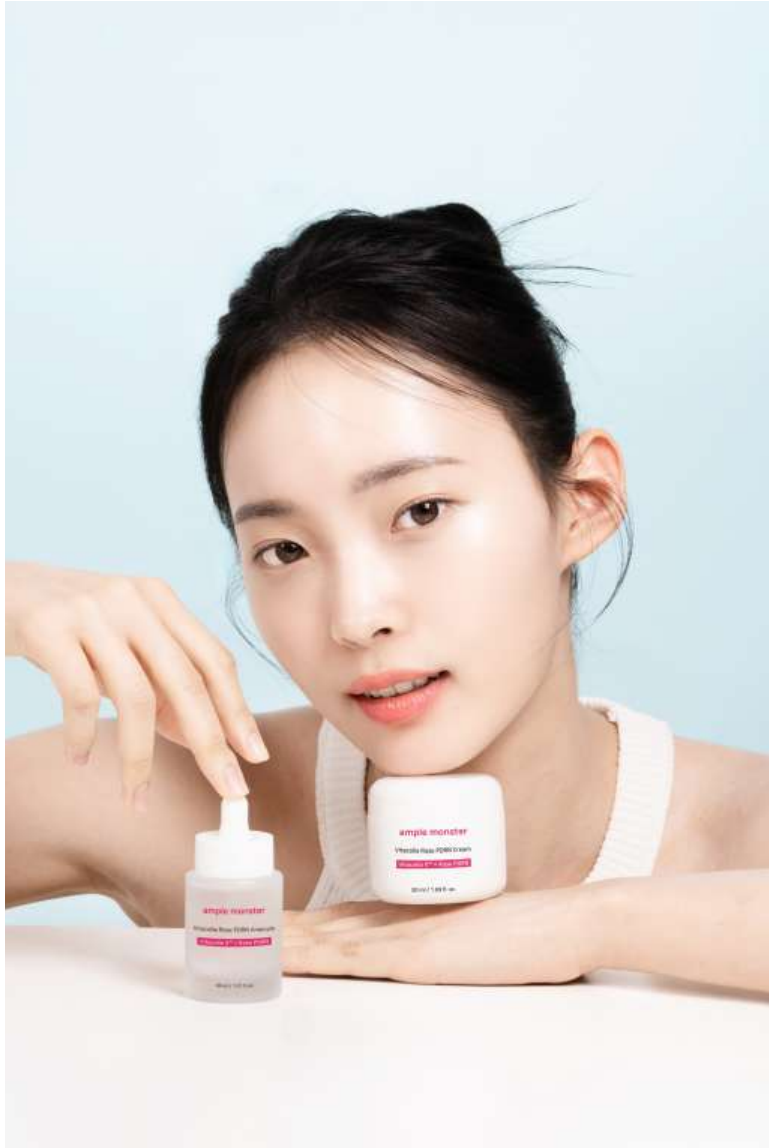
Vitacolla Rose PDRN Cream