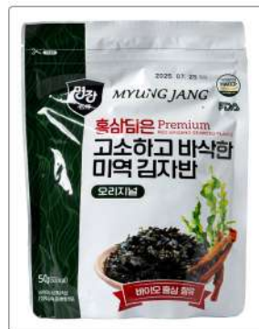
Red Ginseng Seaweed Flakes Contents : 50g