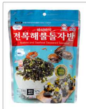
Abalone and Seafood Seasoned Seaweed Contents : 55g