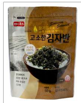
Roasted seaweed flakes stir-fried in sesame oil Contents : 50g