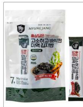
Red Ginseng Seaweed Flakes(Stick) Contents : 56g