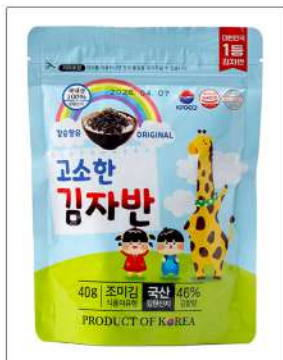
Savory roasted seaweed flakes Contents : 40g