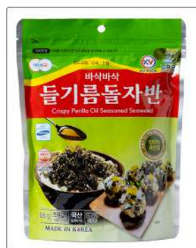
Perilla Oil Seasoned Seaweed Contents : 55g