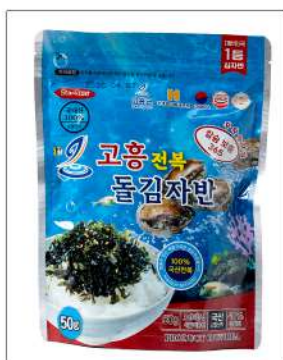
Abalone Seasoned Seaweed Contents : 50g