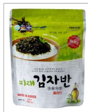
Olive Seasoned Seaweed Contents : 50g