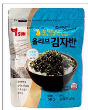
Olive Seasoned Seaweed Contents : 50g