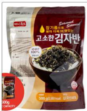
Roasted seaweed flakes stir-fried in sesame oil Contents : 500g