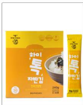
Seaweed Flakes Stick Contents : 240g