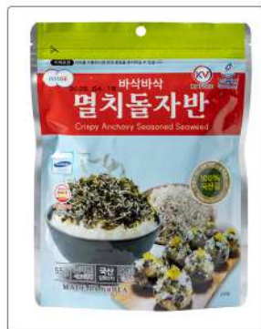
Crispy Anchovy Seasoned Seaweed Contents : 55g