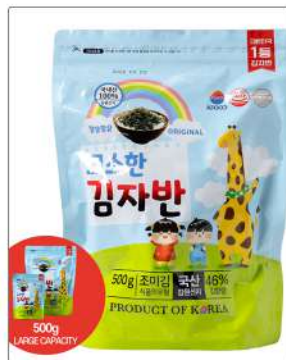
Savory roasted seaweed flakes Contents : 500g