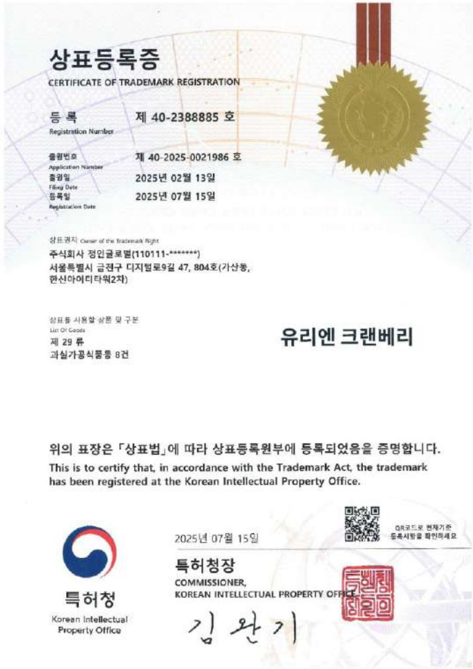
Trademark Registration Certificate for "Uria Cranberry"