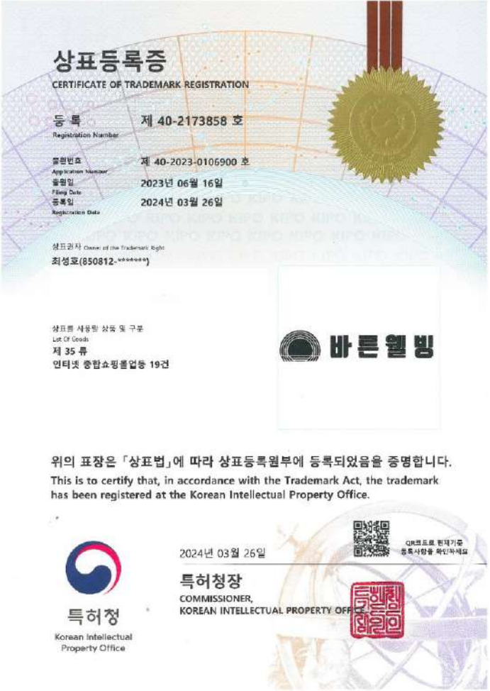
Trademark Registration Certificate for "Barunwellbeing"