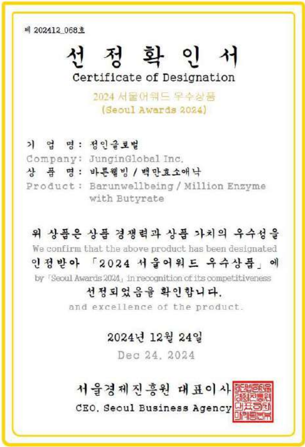
2024 Seoul Award Excellent Product Certificate for "Million Enzyme with Butyrate"