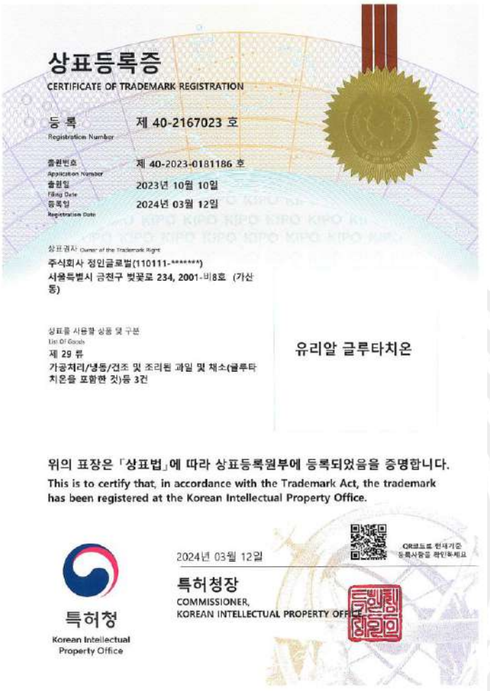
Trademark Registration Certificate for "Glassbead Glutathione"