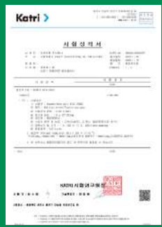
E. coli antibacterial test