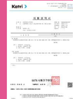
Hazardous substances not detected (test completed)