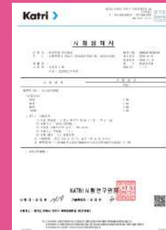
Ammonia deodorization test