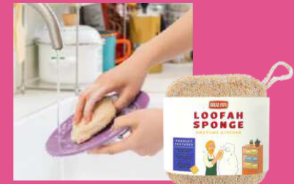
→ Natural Loofah (4-pack)