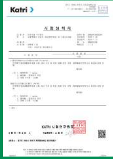
Hazardous substances not detected (test completed)