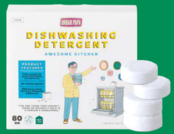
→ Dishwasher Detergent (80 ea)