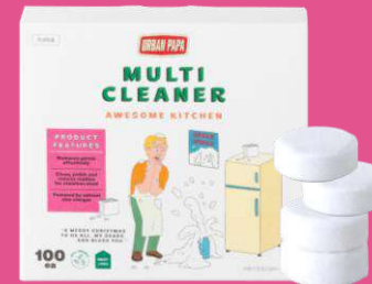
→ Multi Cleaner (100 ea)