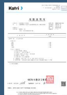
Ammonia deodorization test