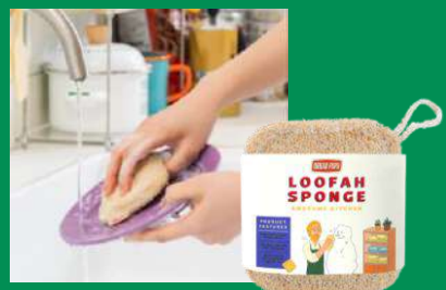
→ Natural Loofah (4-pack)