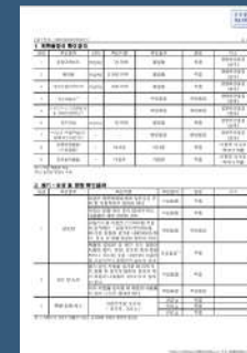
Restricted substances not detected