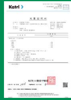
Ammonia deodorization test