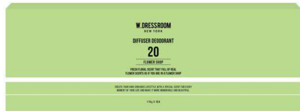
W DressRoom Living Diffuser Deodorant Set of 3 (No.20)