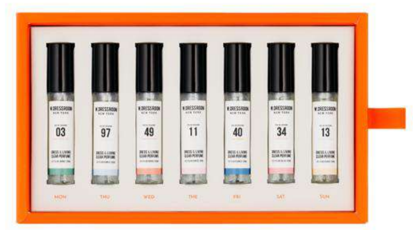
W.DressRoom 24/7 Gift Set

30ml*10 (03,09,30,40,45,48,49,97,214,314)