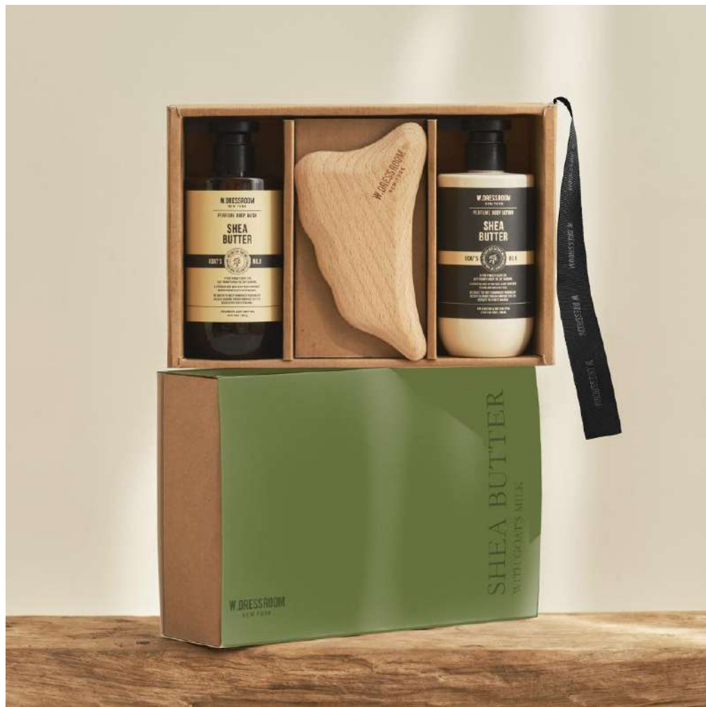
W.DressRoom Perfume Relaxing Body Care Set Shea Butter