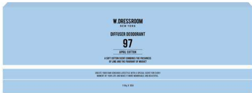
W.DressRoom Living Diffuser Deodorant Set of 3 (No. 97)