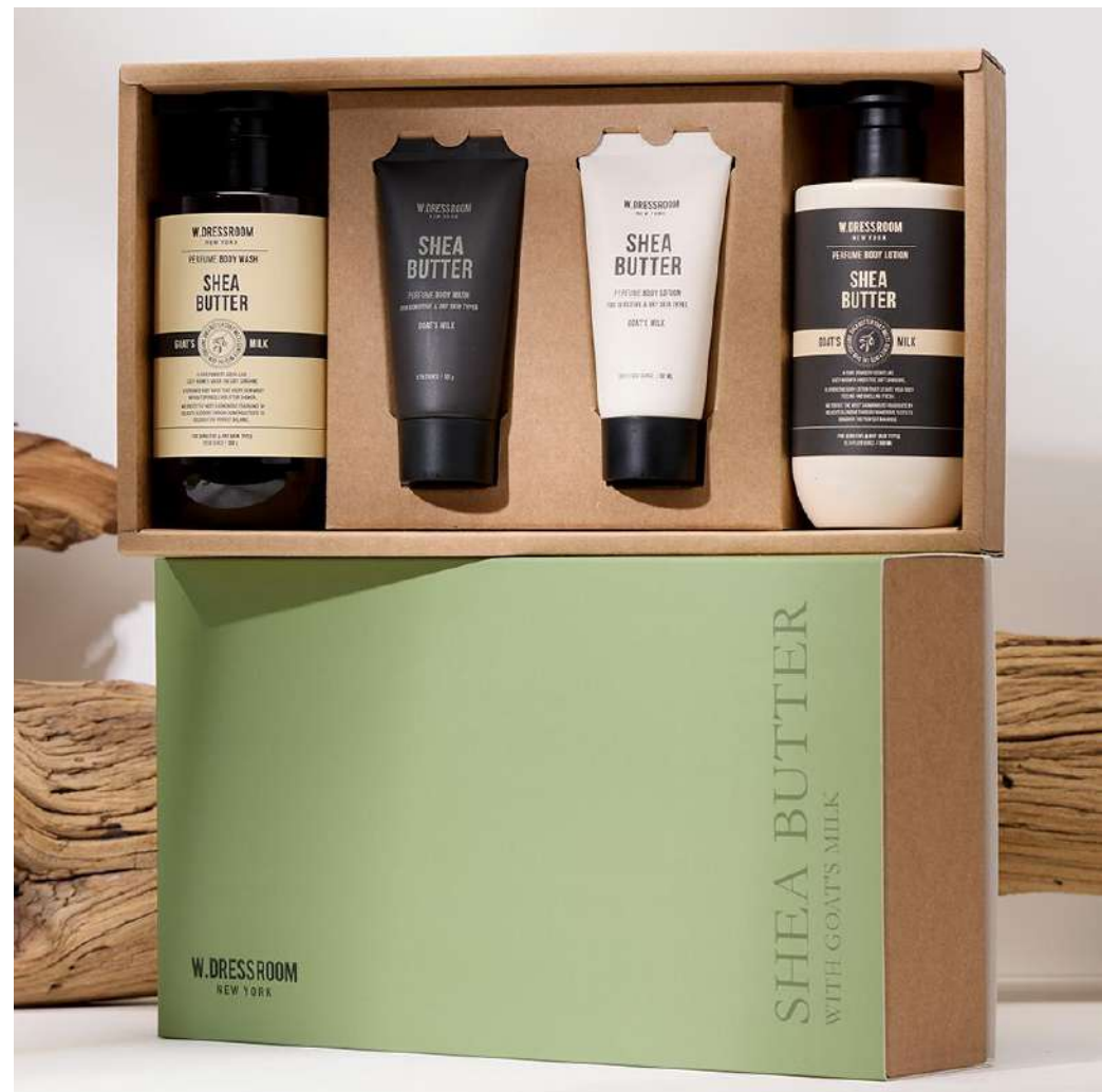
W Dress Room Body Wash & Lotion Travel Gift Set Shea Butter