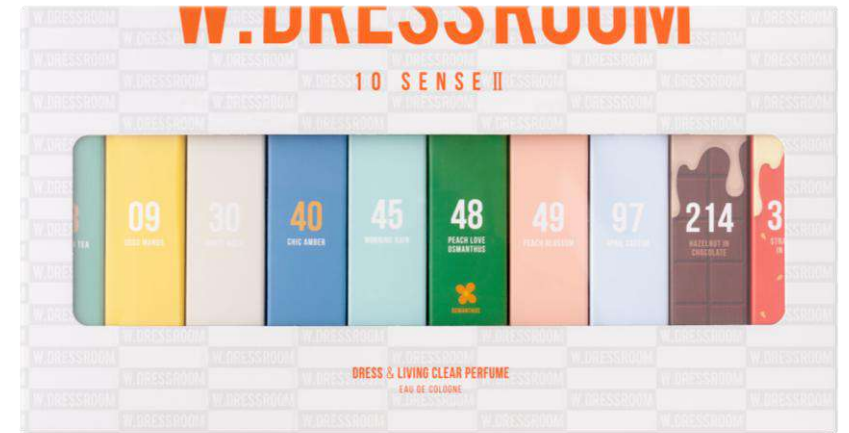
W.DressRoom Dress Perfume 10 Sense Set 2

30ml*10 (03,09,30,40,45,48,49,97,214,314)