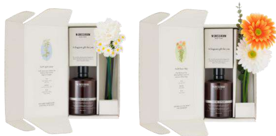
Flower Edition 500 ML (97,20)

Through numerous tests and sophisticated blending, W.DRESSROOM's rich and delicate scent that captures its own emotional style illuminates the daily space.