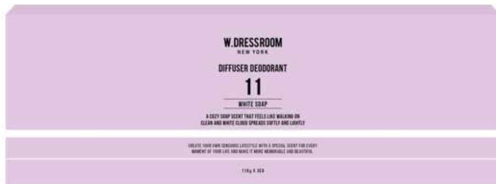
W.DressRoom Living Diffuser Deodorant Set of 3 (No. 11)