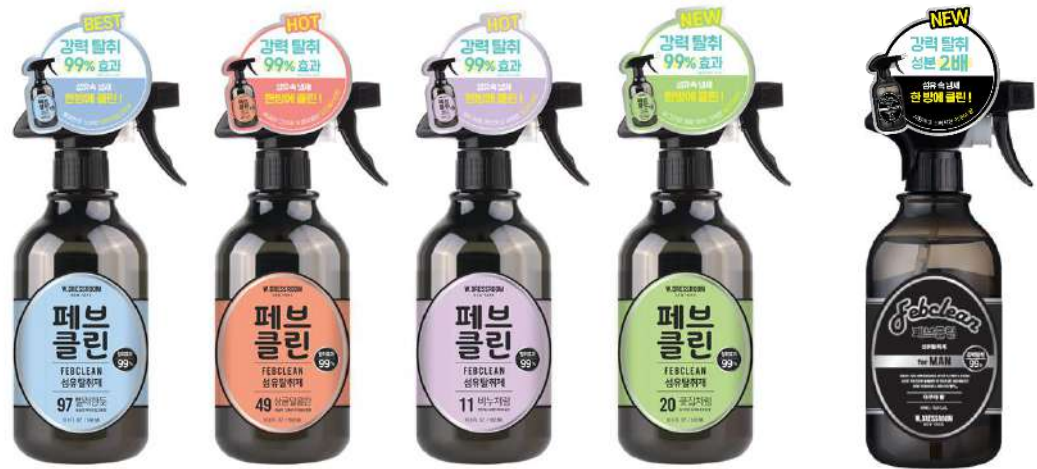
Basic line (97,49,11,20)

#Antibacterial & Deodorizing #Anti-static #Low Stimulus Test Completed #Strong Spray