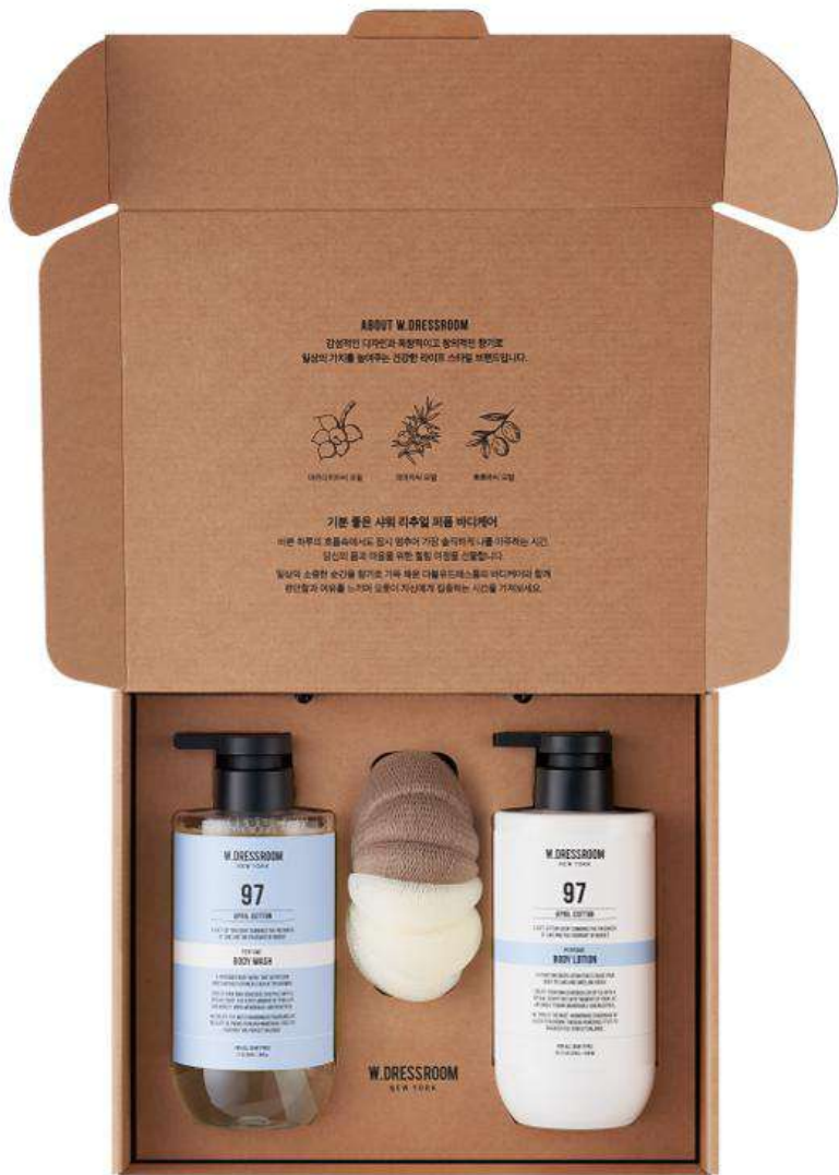
W.DressRoom Perfume Body Care Set (No. 97)