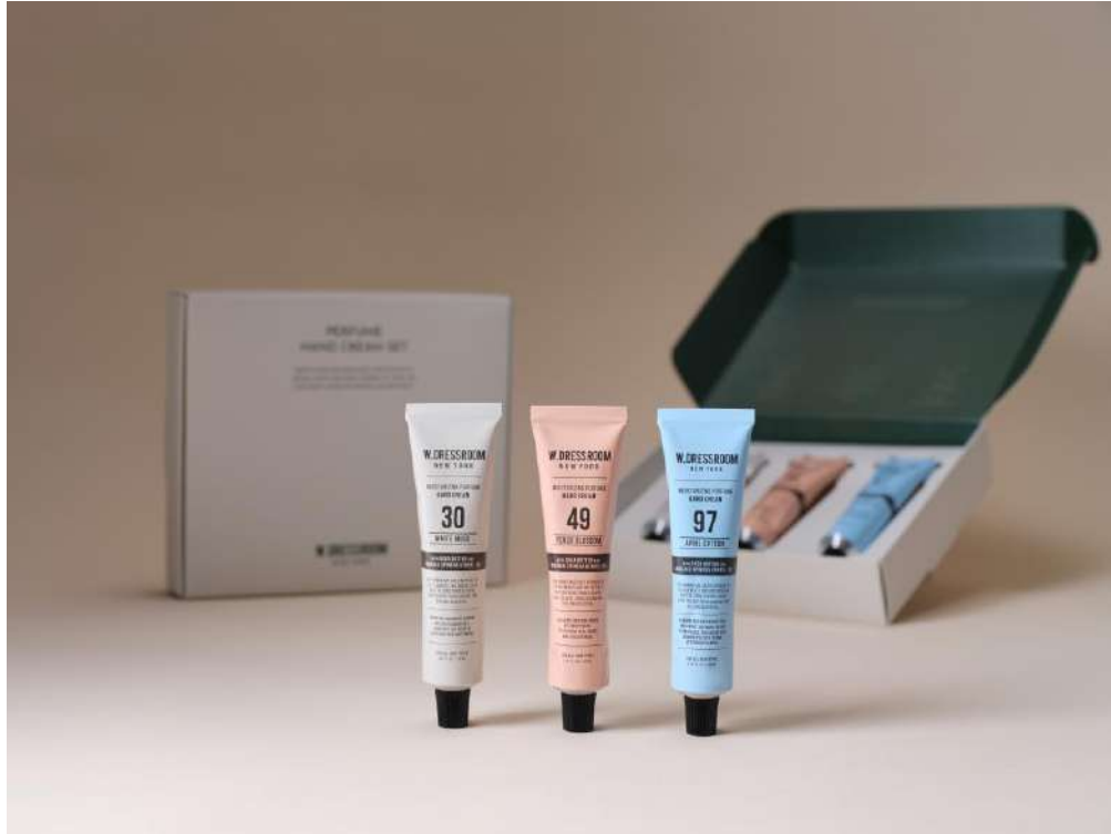
W.DressRoom Perfume Hand Cream Set of 3 Gift Set