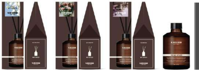
Single Unit 500ML (97,20,65)

#Space-filled scents #HighCapacity #SeniorSteamer #SoftRemovement