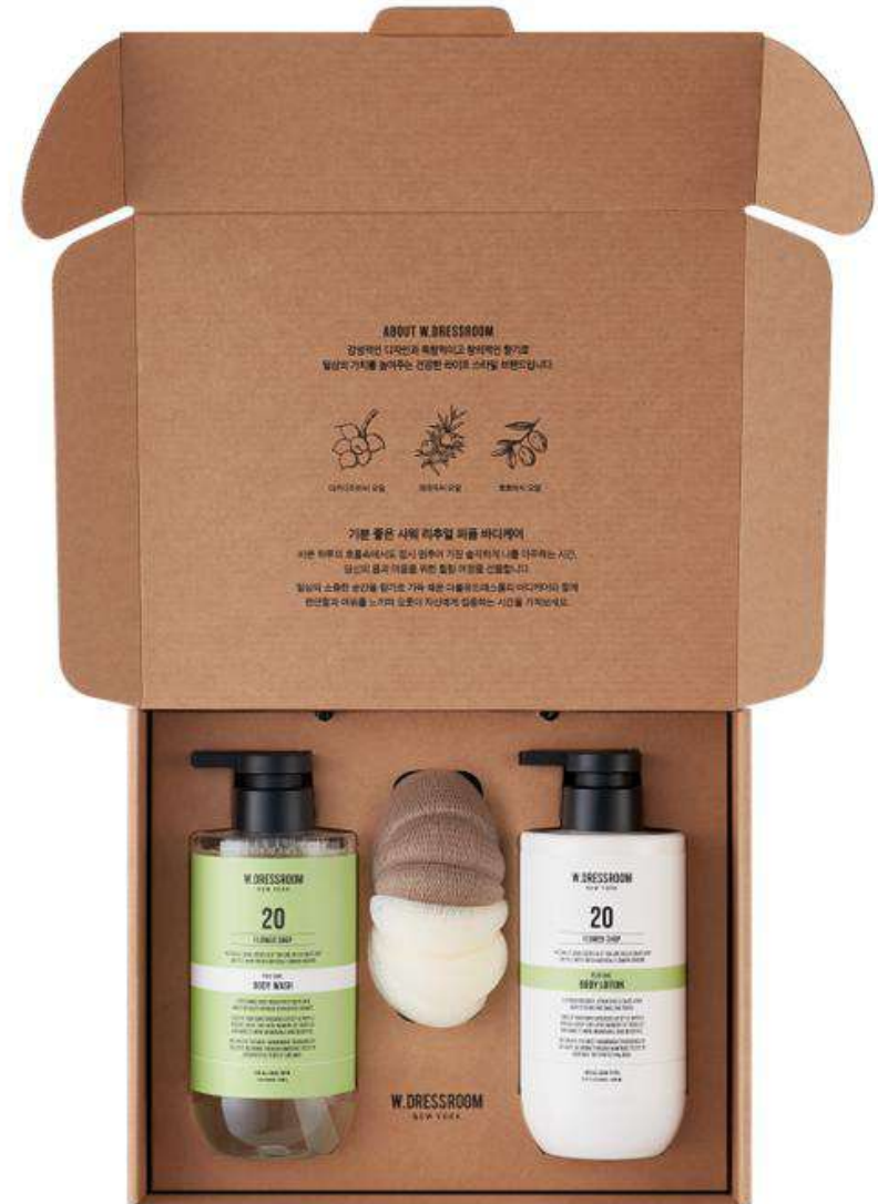
W.DressRoom Perfume Body Care Set (No.20)