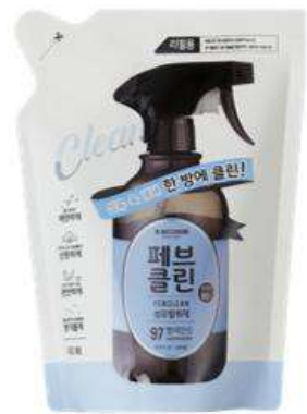
Fevclean Refill Pack (97)