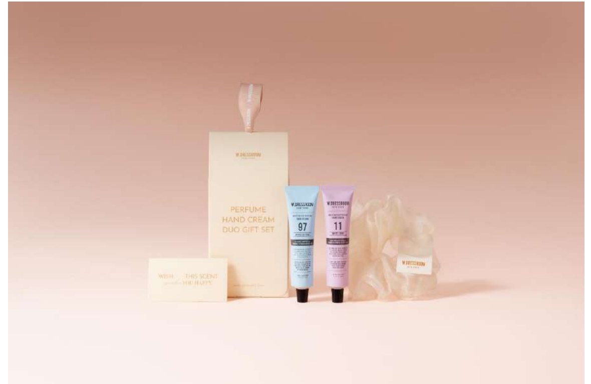
W Dressroom Perfume Hand Cream Best Duo Set