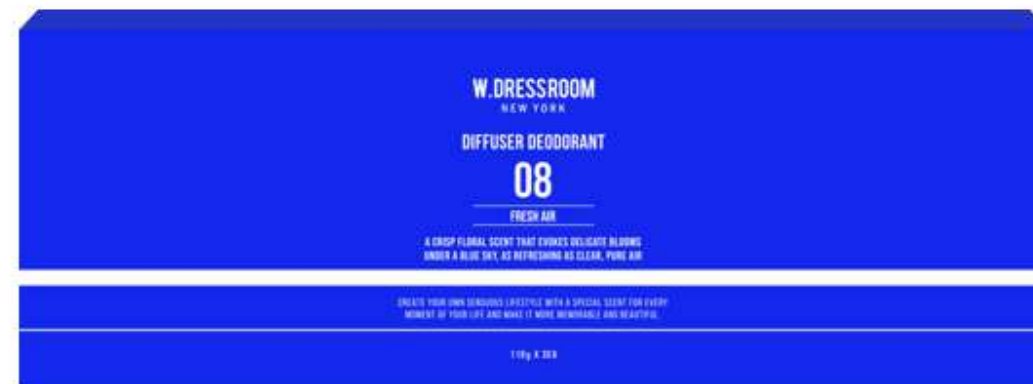
W DressRoom Living Diffuser Deodorant Set of 3 Pieces (No.08)