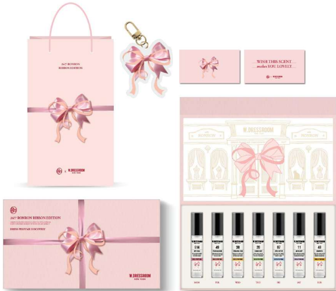
W.DressRoom X Ronon 24/7 Discovery Set