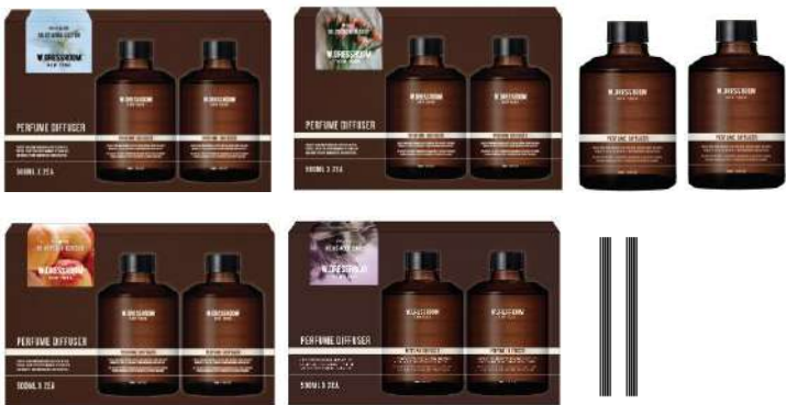
2 pieces set 500ML*2 (97,20,49,65)