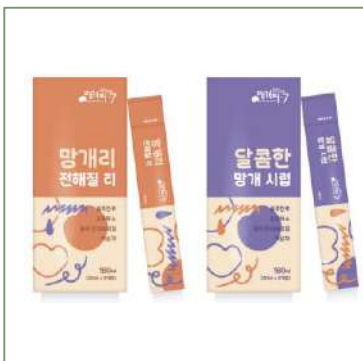
6 Manggae Electrolyte tea