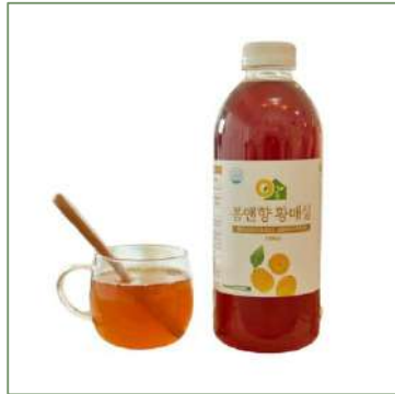
2 yellow plum bottle