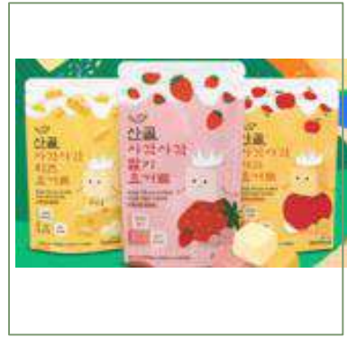
3 quare yogurt cubes