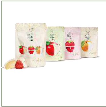
2 fruit chip