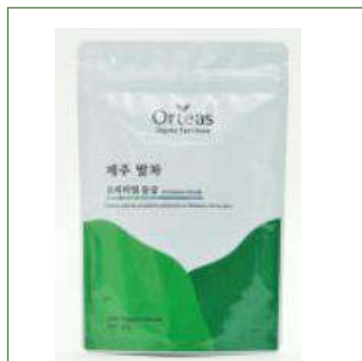
7 Organic Matcha