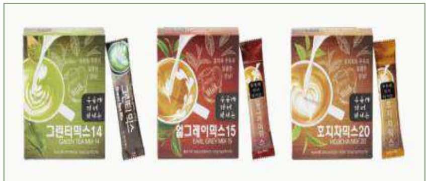
5 Hojicha mix/Earl Grey mix/Green tea mix