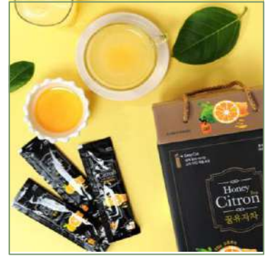
3 Honey Yuzu Stick Honey Grapefruit Stick