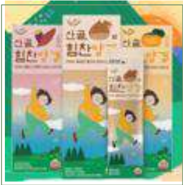
4 red bean paste jelly