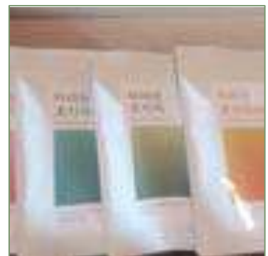
8 Hoji tea