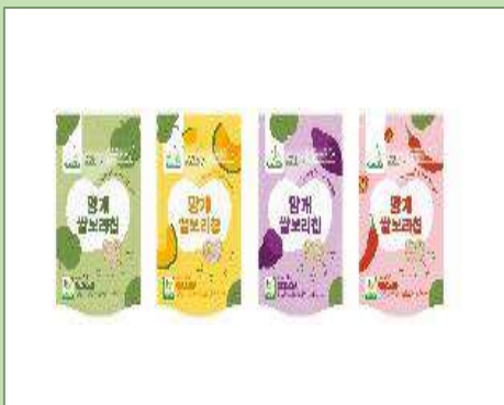
7 Manggae Rice chip