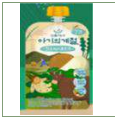
5 Baby Food