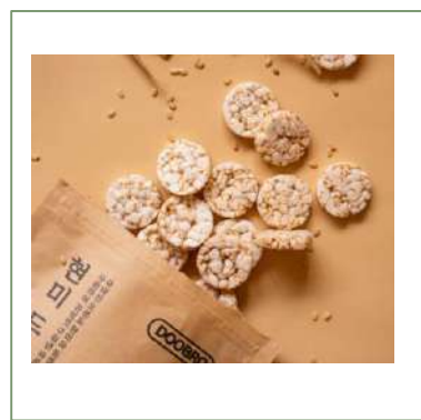
6 Brown rice tofu rice crackers