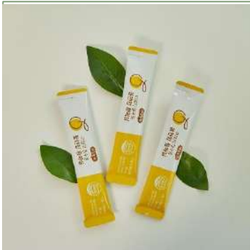
1 yellow plum stick