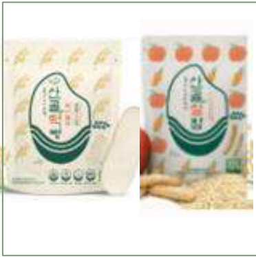
1 rice chip