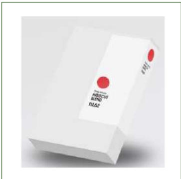
4 Blending Tea (Raw materials/products)