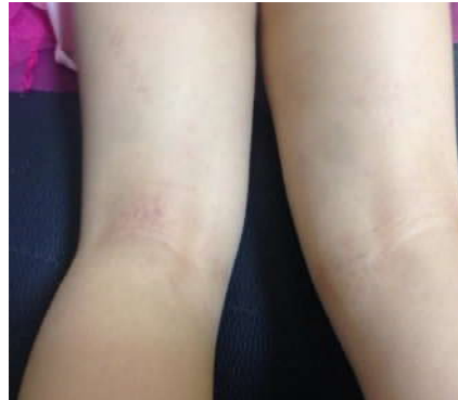
After 3 rd Application (15 min.)