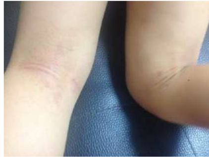
After 1 st Application (15 min.)