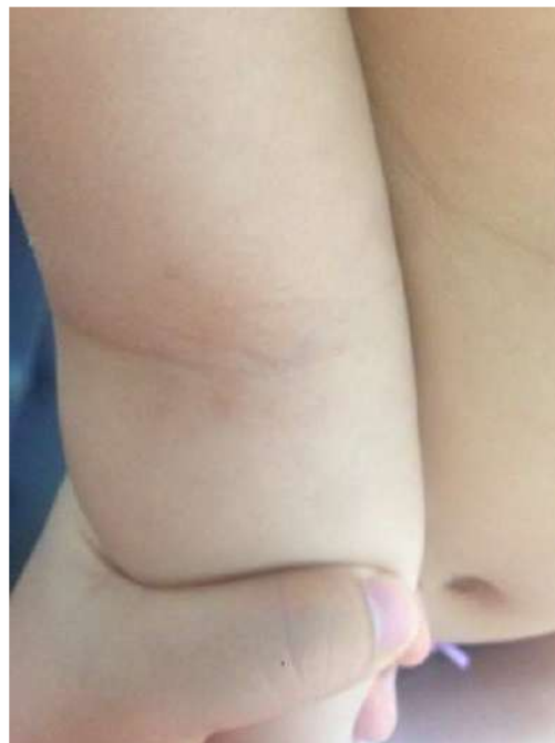
After 1 st Application (15 min.)