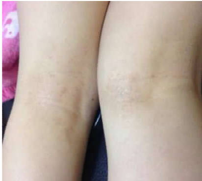
After 2 nd Application (15 min.)